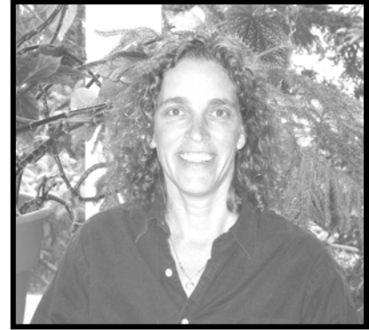
AWARE Executive Director

October is Domestic Violence Awareness Month. This column is dedicated to the courageous women who call AWARE's hotline or walk through AWARE's doors, facing their fears in order to find their freedom. I ask each of you reading this to support AWARE's mission in whatever way fits for you - it might be sending a donation to AWARE or volunteering your time; it might be wearing the purple ribbon of domestic violence awareness or donating an item for AWARE's Women of Distinction silent auction; it might be coming to an awareness event or calling AWARE and asking how you can best help a friend. I ask this because providing effective intervention and critical prevention is a job for a community - AWARE can't do it alone- we need each of you, in your own special way, to share in our work of empowering those whose power has been taken from them, so that each of us may become our very best self.